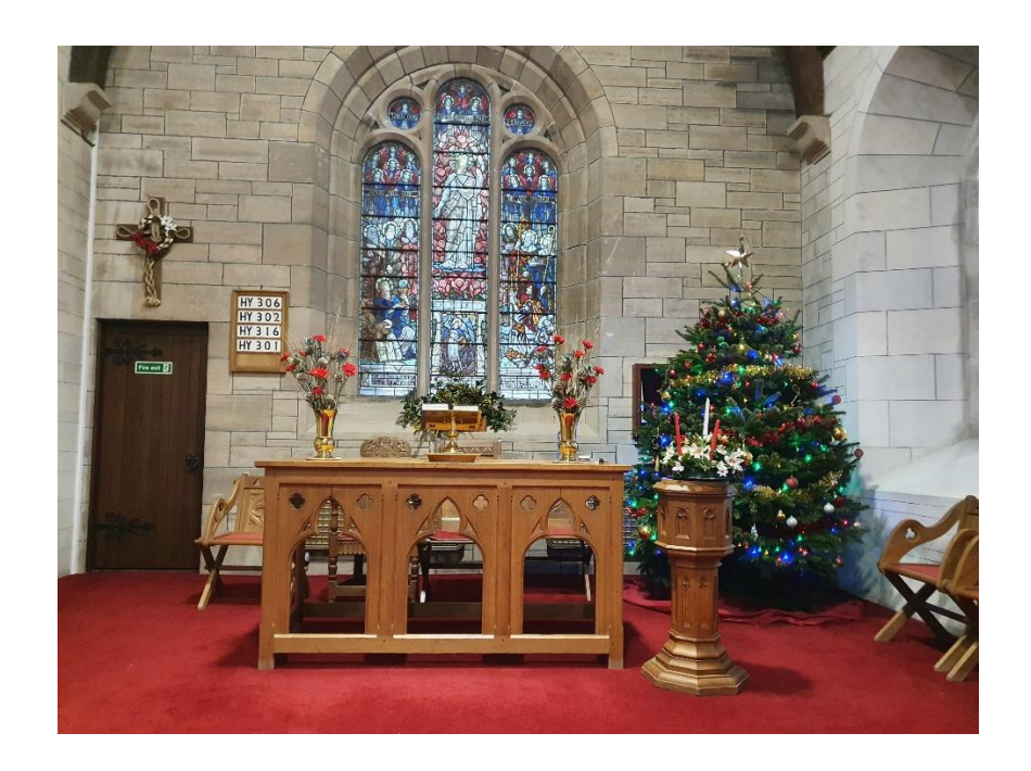
The church decorated for Christmas 2022.

However, as a charity, we should have Gift Aid Declarations which have been signed in the last 2 years. If you have not signed a declaration form recently; Gift Aid Declaration Forms are available from your Elder, the Session Clerk or Treasurer. Completed forms should be returned to them.